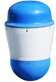
Buoys for free floating in pool